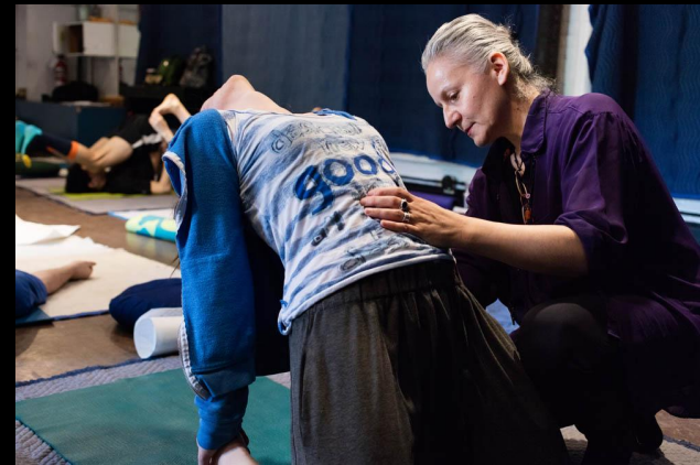
safe space for perpetual progress & discovery