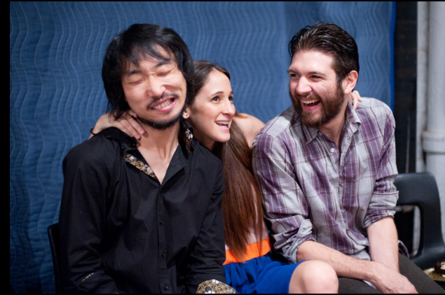
work, learn & grow with the same ensemble