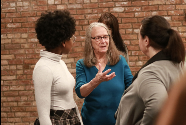
world-class faculty & practitioners