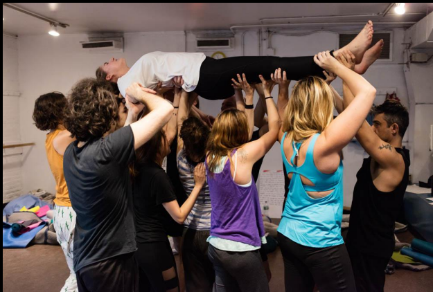
supportive, yet challenging environment